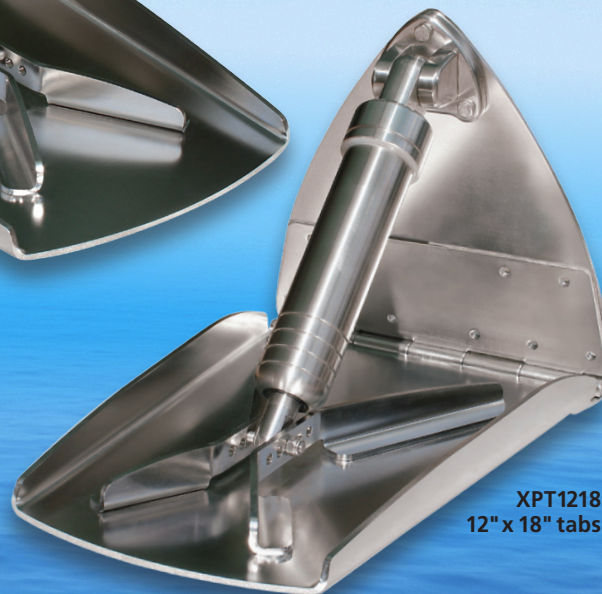
XPT1218 12" x 18" tabs